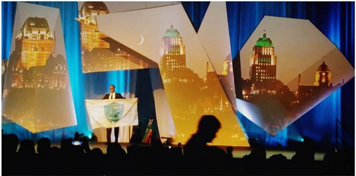
JCI West Indies 2016 World Congress delegates